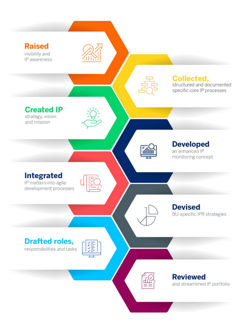
Figure 1 - IP transformation initiatives

At the end of the project, the IP department took over the final steps of the IP transformation. With the one-off tasks accomplished, the initiatives' work was completed. What remained was to integrate all ongoing efforts into the day-to-day operations of the IP team, which now operated at the center of the business.