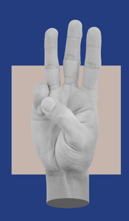
UP / UPC goes live June 1, 2023